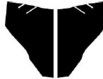
Truck Side Cowl Panel Kit