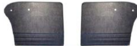
Door Panel Kit Molded with Factory Ribs

Dodge Truck Interior Kits are an exact duplicate of original patterns supplied by our customers. We use a leather-grained ABS material that will not warp with heat or moisture, scratch or chip. Truck Cowl Panels and the Rear Cab Cover Panel Kit is the same for all years.